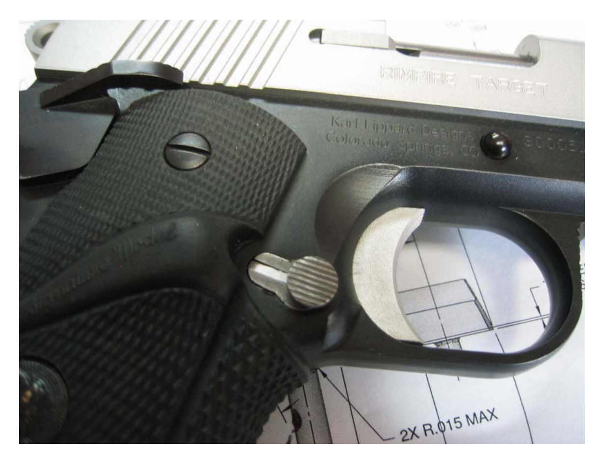
Figure 5. Ambi-Mag Release fully seated and installed

Actuate the Release button on the right side and feel for any drag on the Tap. If drag or scrapping is noted, remove the Release and remove more material.