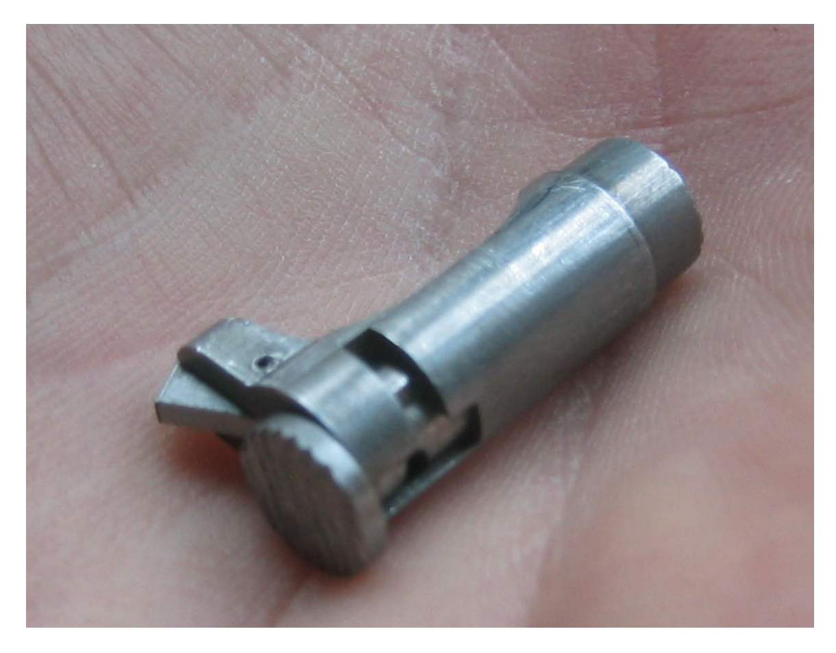
Figure 4. Release in the install position turned 90 degrees left.